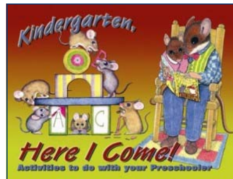
Above: Pictures of the various Early Learning Guides available for distribution.