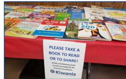
Above: (1) A club member reads to children. (2) Books are ready to be shared with children to read and take home.