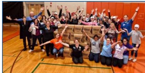
Above: Region 7 Kiwanis Family members celebrate packages being boxed and completed!

Pennsylvania Kiwanis Region 7 was able to partner with Rise Against Hunger to package 10,152 meals in 2 hours with the local Kiwanis Family through the generosity of the Foundation and all of Region 7 Clubs. Rise Against Hunger is an international hunger relief organization that distributes food and life-changing aid to the world's most vulnerable, and focuses on mobilizing the necessary resources to end hunger by 2030.