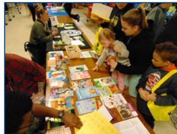
Left: (1) Children display their bags filled with books and safety items. (2) Families stop at a table with children’s books.