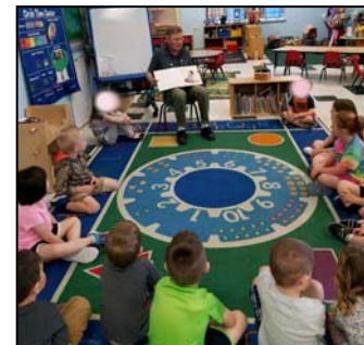
Above: A club member reads to a pre-school class.

Every month, the Kiwanis of Edinboro members read to five local pre-school classes. Thanks to a grant given by the Foundation, the club was able to give the books to the classrooms for the children to enjoy over and over again. The debate remains to who has more fun - the kids or the Kiwanis members.