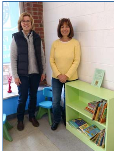
Above: Kiwanis members smile for a picture in one of the laundromat libraries.