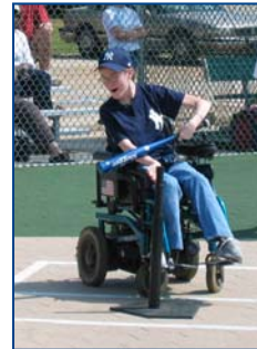
Left: (1) Picture of the Miracle League Baseball Field behind the Kiwanis Clubhouse in Altoona, Pennsylvania. (2) Picture of batter getting ready.