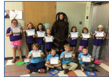
Above: Local elementary students display their certificates proudly with the “BUG”.